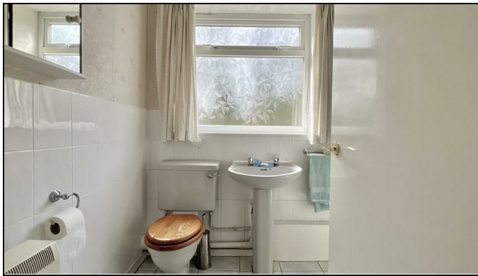
Trident Close, B76 1LF